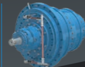
Brevini™ Winch Drives SLW Series